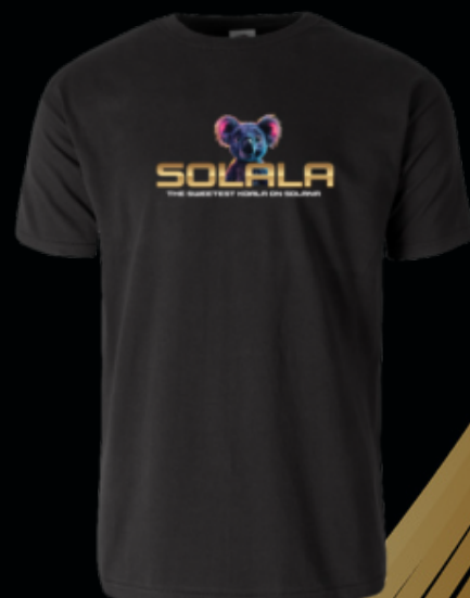
The sweetest koala on Solala