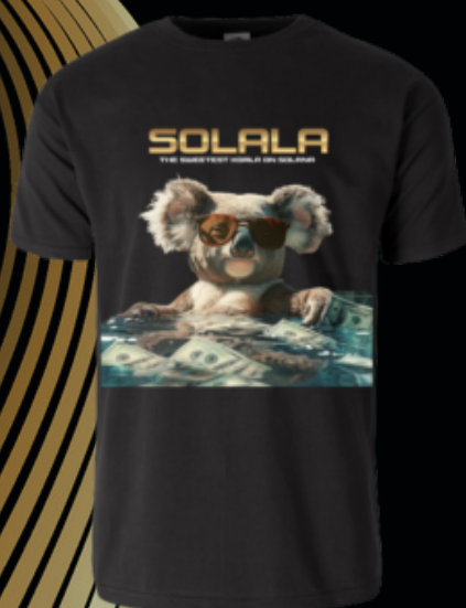
Get rich on Solala