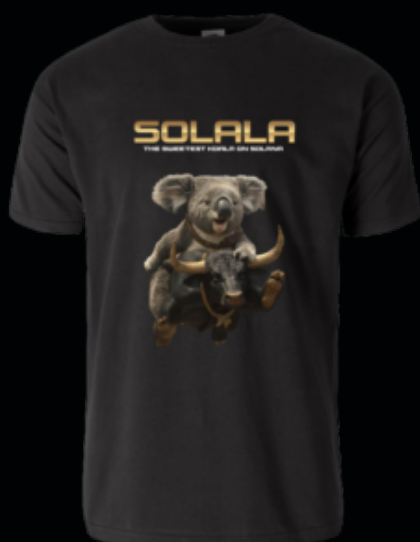
Ready for bullrun white Solala